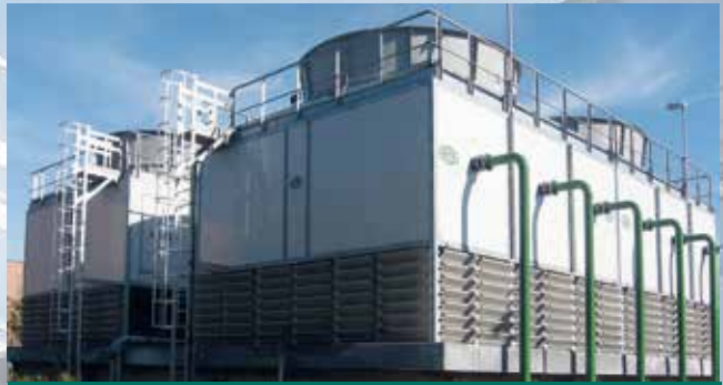
Plant after the replacement with MITA modules