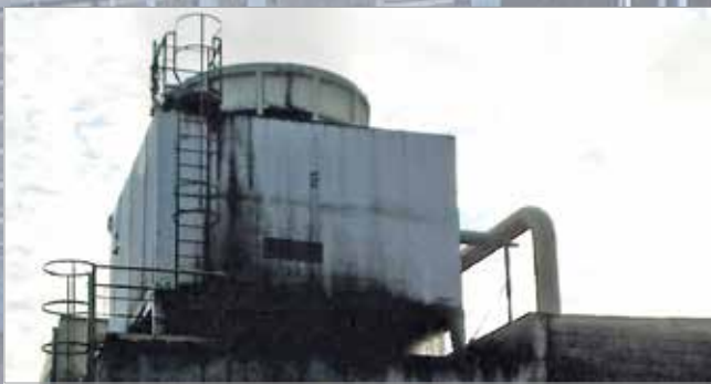
Plant before the replacement with a MITA solution