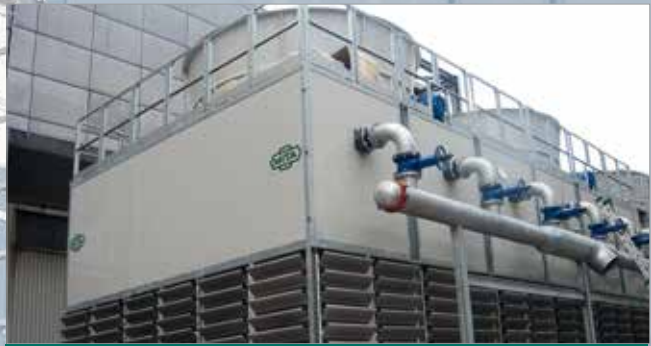
Plant after the replacement with MITA modules