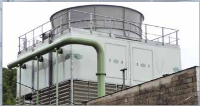
Plant after the replacement with MITA modules