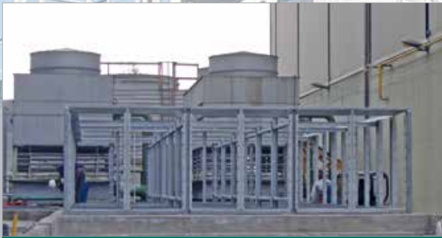
Plant before the replacement with a MITA solution