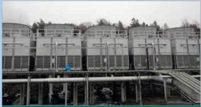
Plant after the replacement with MITA modules